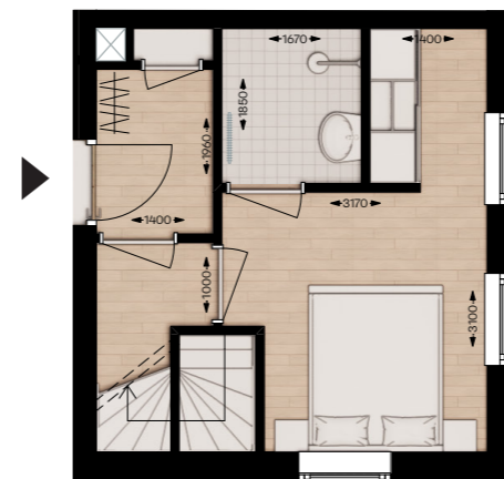
-01 souterrain 23,3 m 2