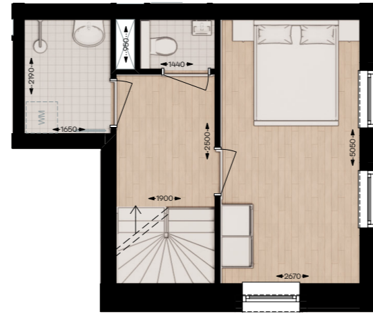
01 eerste verdieping 26,9 m 2